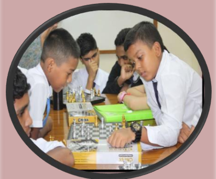
Read about our new Enrichment Programme P4-5