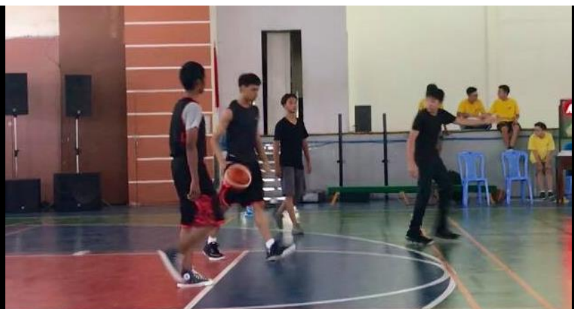
The boy's team haven't been able to keep up their winning spree, but we're hopeful!