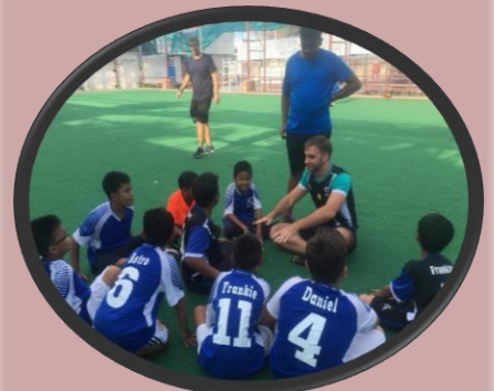
Catch up on our school sports news. P9.