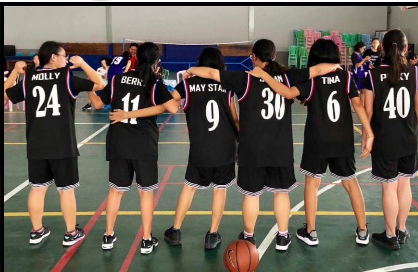
Our secondary girls, in an impressive basketball debut! (excuse the photobomber)