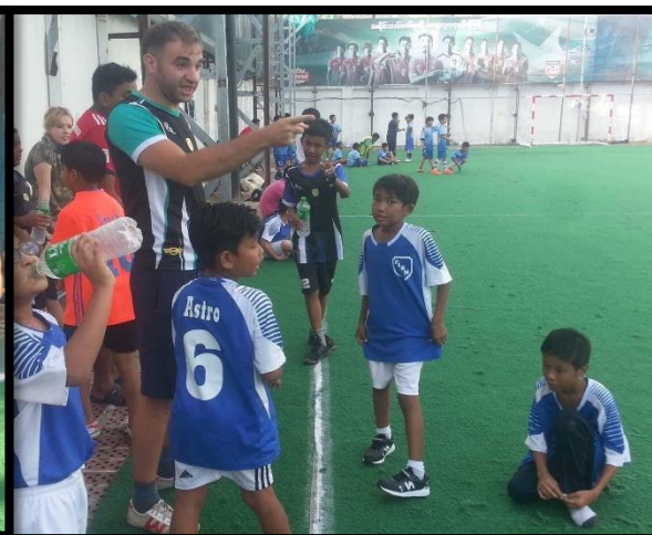
Two wins and one defeat for the U11 football team so far. Wish them luck!